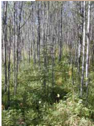
Spruce Below Unthinned Aspen