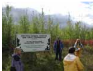
WESBOGY Tour—DMI Installations