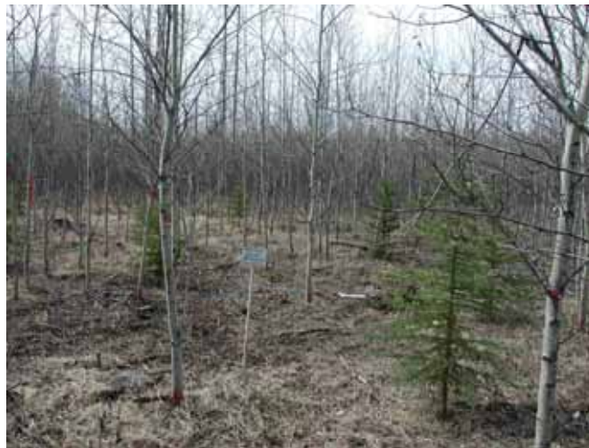
WESBOGY PLOT—Aspen ( 4000 Stems/ha) —Spruce (500 Stems/ha)

The field manual for long term study data collection is currently under revision. The updated version will be released in 2003.