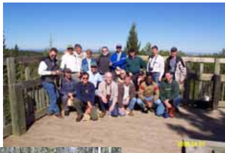
Riding Mountain Annual Meeting 2002

Analysis of long term study data brought plot size issues to the fore-front. The study design calls for the natural plots to begin by using small 1m x 1m plots, then progressing to 2m x 2m, 5m x5m and finally the full plot size of 20m x 20m. This was done due to address problems with using large plots where starting densities were extremely high. A trial was set up in cooperation with Weyerhaeuser, Grande Prairie to determine if there was bias caused by plot size. The results clearly showed that comparisons between treated and untreated aspen plots are biased.